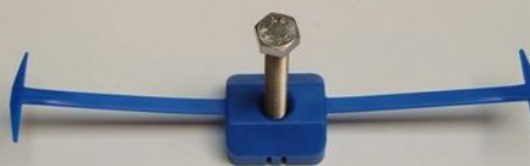
The Ikadan Smart-Fastener for concrete flooring

Smart-Fastener for plastic flooring requires a 10 mm slot opening and the one for concrete flooring requires a 16 mm slot opening.