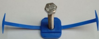
The Ikadan Smart-Fastener for plastic flooring

Ikadan Smart-Fastener consists of a stainless steel nut embedded inside strong plastic. Bolts and washers are also included.